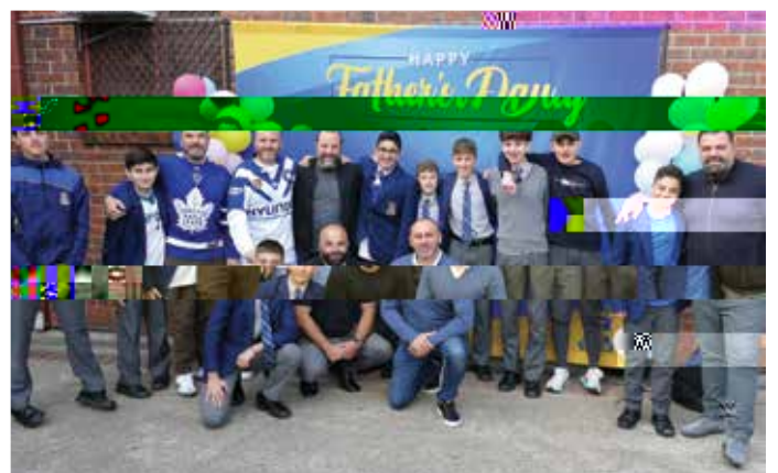
Left St Pius X Day Top right Youth Mass at Our Lady of Dolours Parish Church Bottom right Father's Day celebrations