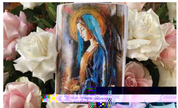
Left Junior School Assumption Mass Top right Mother's Day celebrations Bottom right Feast of the Assumption Mass Booklet