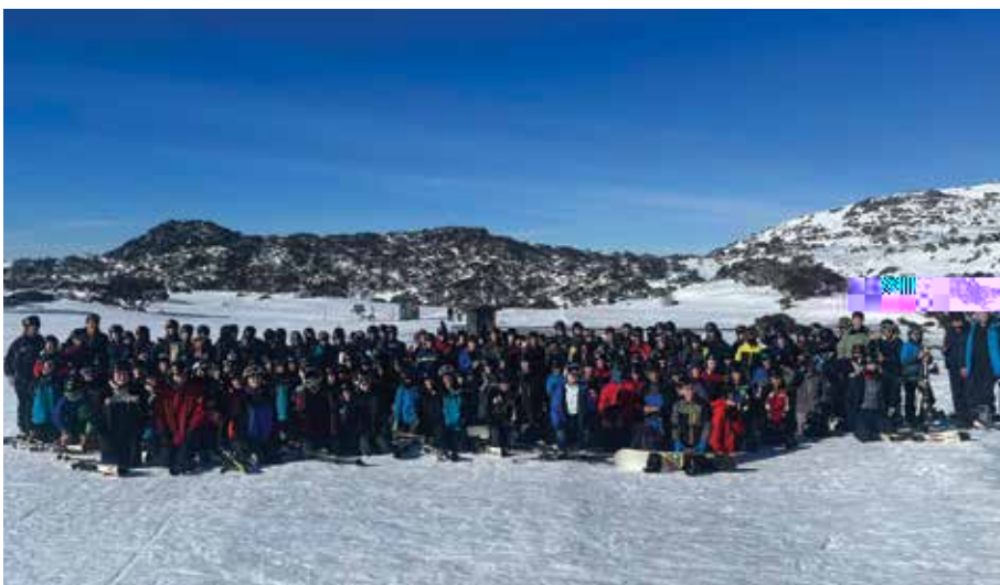
Top left Proudly supporting Jersey Day Top right Year 12 student leaders decorating the school for R U OK? Day Bottom left Year 8 Ski trip Bottom right One of the Year 12 retreats